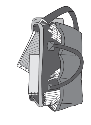
© Cambridge University Press and UCLES 2019